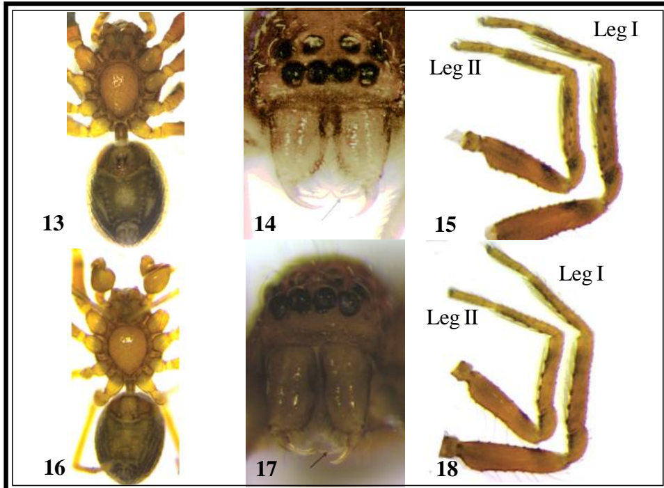
Figs 13-18. Orthobula impressa Simon, 1897., 13, Female: ventral view, 14, cheliceral frontal view showing basket hairs, 15, female Leg I, II, prolateral view; 16, Male: ventral view, 17, cheliceral frontal view showing basket hairs, 18, leg I, II, prolateral view.