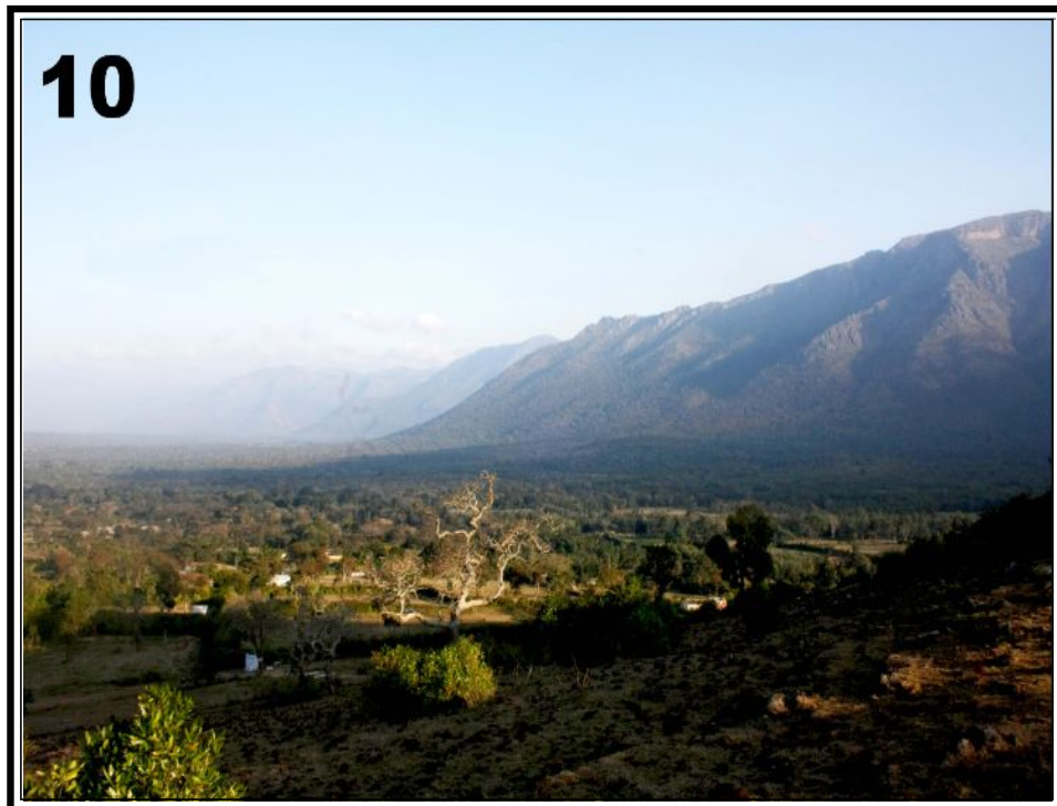
Figure-10, Habitat at the type locality of Heterometrus atrascorpius sp. nov.