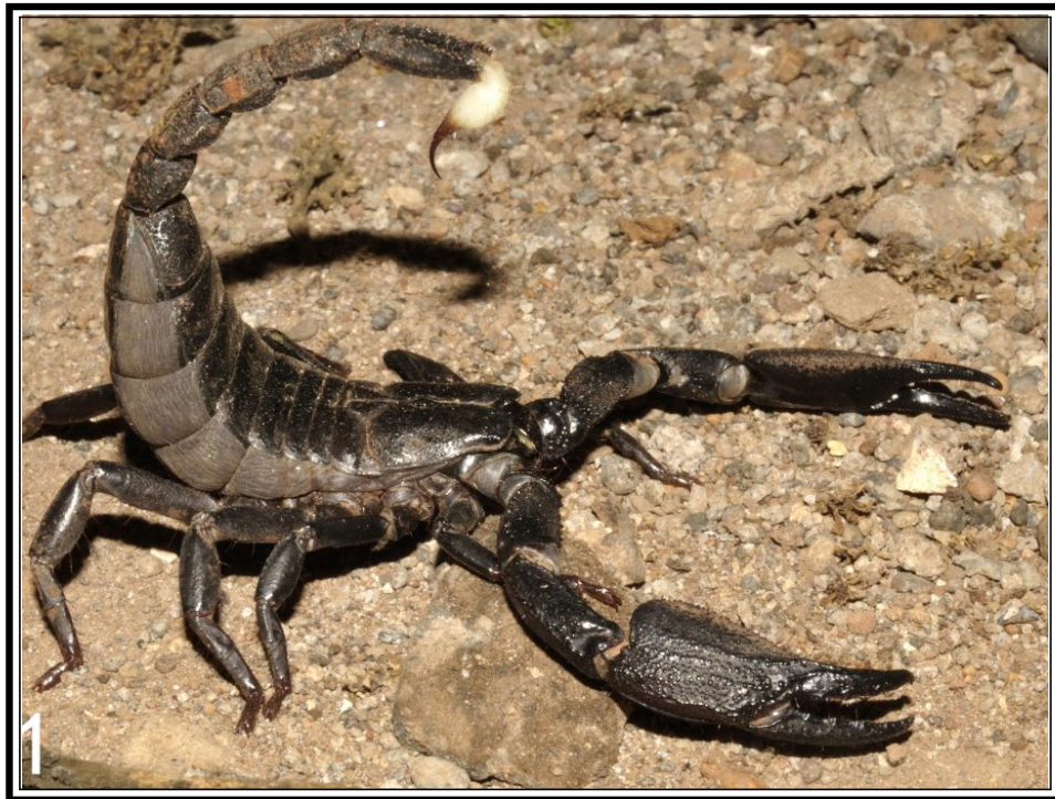
Figure-1. Dorso-lateral view of adult female Heterometrus atrascorpius sp. nov. in life